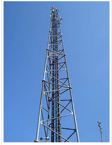
A Greenfield-type tower used in base stations for mobile telephony

The World Health Organization, based upon the majority view of scientific and medical communities, has stated that cancer is unlikely to be caused by cellular phones or their base stations and that reviews have found no convincing evidence for other health effects.<sup>[2][3]</sup> Some national radiation advisory authorities<sup>[4]</sup> have recommended measures to minimize exposure to their citizens as a precautionary approach.